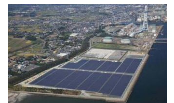
Mega Solar Taketoyo