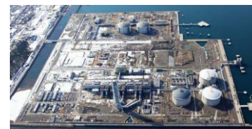
Joetsu Thermal Power Station