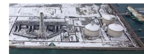
Joetsu thermal power station