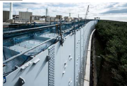
Tsunami protection wall