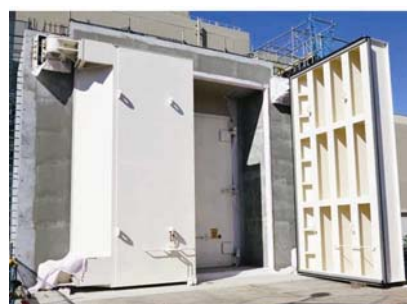
Tsunami protection doors