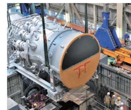
Chita Daini Thermal Power Station, Unit No. 2 gas turbine