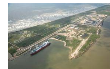
Freeport LNG terminal