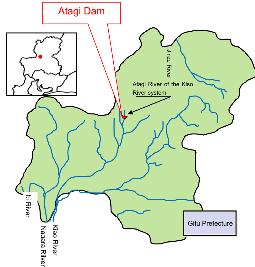
Schematic location map