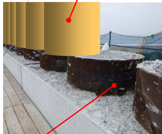
Completed removing crown concrete 【Image of raising the wall's height of the western end】